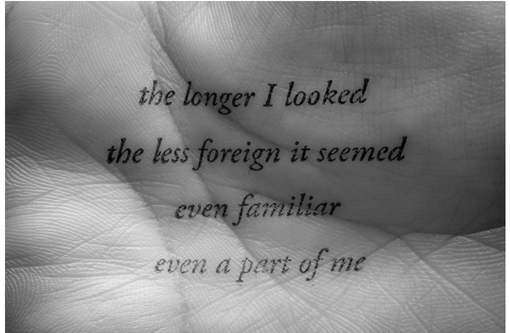
Christian Vogt, the longer I looked , 2008 Skinprints series Pigment print, 80 x 127 cm, edition of 3

"There are also different interactions between pictures and text. All the thoughts that I expressed in Skinprints I actually originally wanted to use in Photographic Notes. But it didn't work. Certain texts lose their sense because one immediately connects them to the picture. Sometimes that can work well and text and image reciprocate — but often not. In Skinprints, however, the texts have much greater autonomy with regard to both content and form."