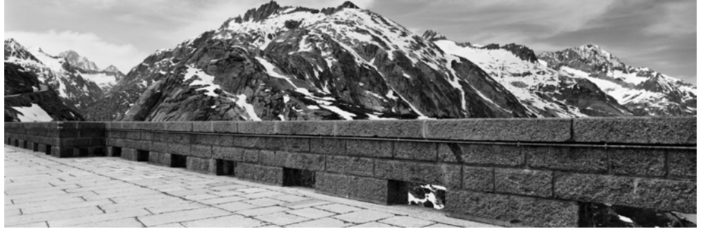
Christian Vogt, Grimsel , 2011 Pigment print, 80 x 242 cm, edition of 3