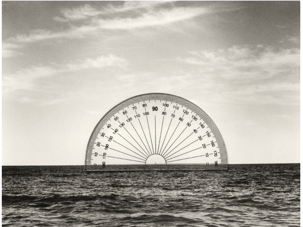
Chema Madoz, Untitled , 2007 Gelatin silver print, 16 x 26 cm Edition of 25

The use of images is exclusively reserved for the promotion of the exhibition and valid up to its end.