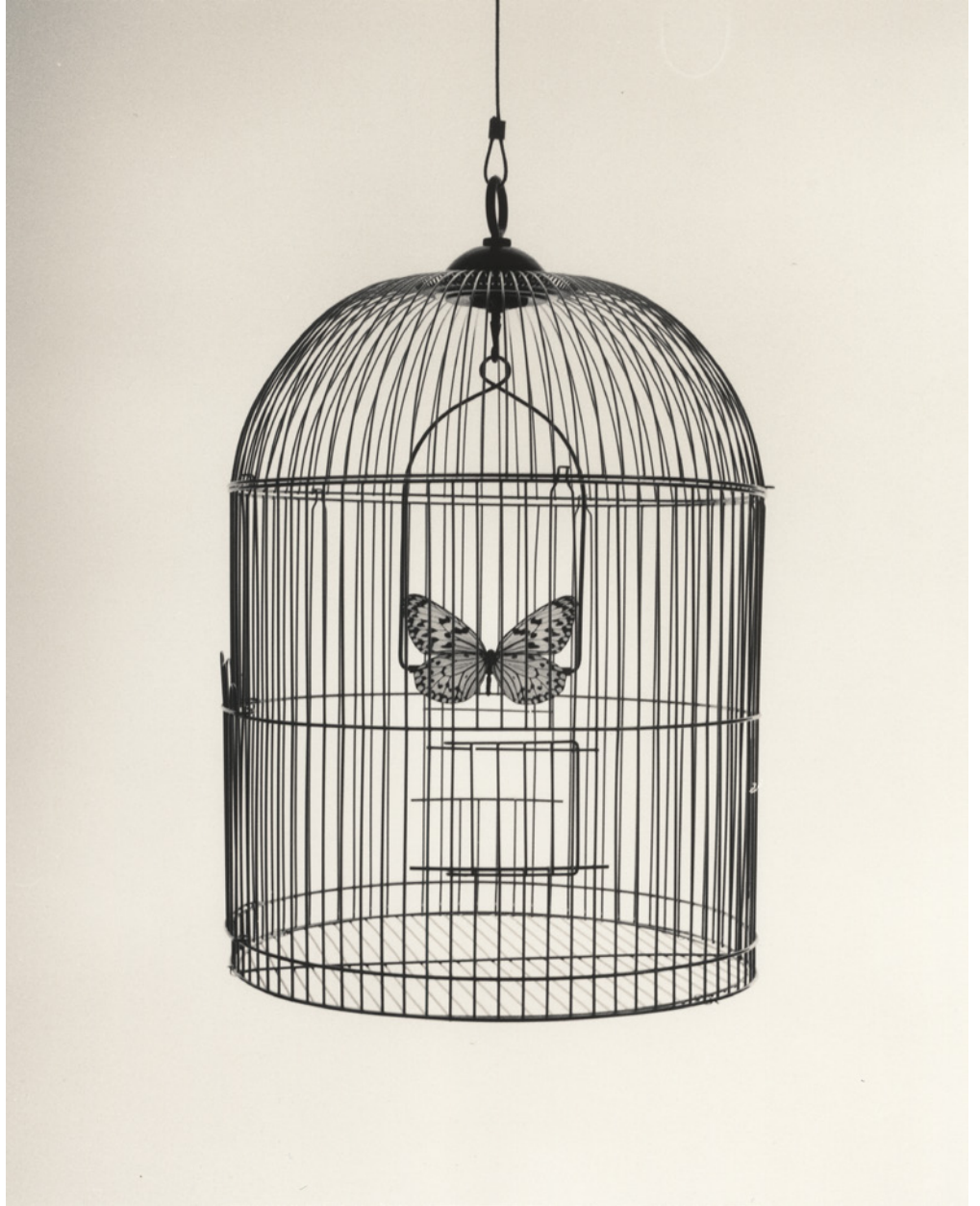
Chema Madoz, Untitled , 2010 Gelatin silver print, 60 x 50 cm Edition of 15

The use of images is exclusively reserved for the promotion of the exhibition and valid up to its end.