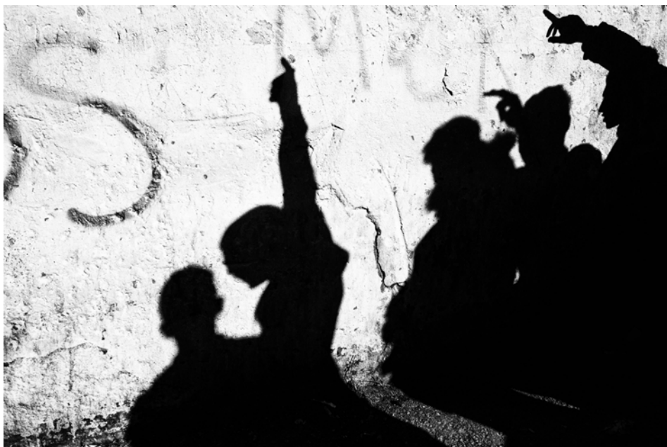
Youcef Krache, Prémices d'une victoire , Extraite du projet El Houma , Climat de France Alger, 2017 Pigment print, 40 x 50 cm, edition of 5

The use of images is exclusively reserved for the promotion of the exhibition and valid up to its end. Obligatory mention: © Youcef Krache, Courtesy Galerie Esther Woerdehoff