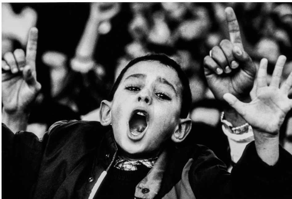
Michael von Graffenried, Manifestation sur la place des Martyrs à Alger , 1991 Vintage gelatin-silver print, 30 x 40 cm

The use of images is exclusively reserved for the promotion of the exhibition and valid up to its end.