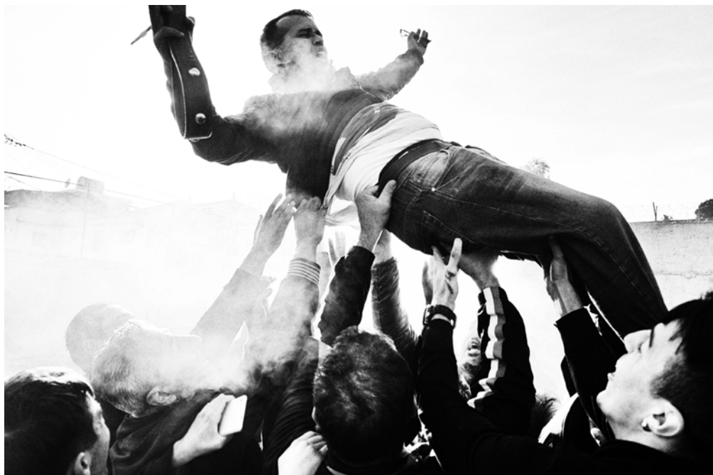
Youcef Krache Série 20 cents, Djnan Lakhdar Alger, 2017 Pigment print, 40 x 50 cm, edition of 5

The use of images is exclusively reserved for the promotion of the exhibition and valid up to its end. Obligatory mention: © Youcef Krache, Courtesy Galerie Esther Woerdehoff