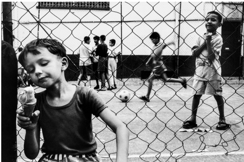
Michael von Graffenried, Terrain de jeux à Alger , 1992 Vintage gelatin-silver print, 30 x 40 cm

The use of images is exclusively reserved for the promotion of the exhibition and valid up to its end.