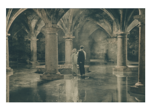
Aassmaa Akhannouch Les fiancés, 1985 Series Un monde oublié, Cyanotype transferred and enhanced with watercolour on fine art paper

The use of images is exclusively reserved for the promotion of the exhibition and valid up to its end.