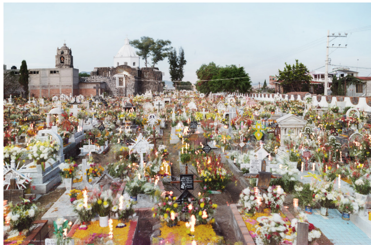
Michael Wesely, B6649 Mexico series, pigment print Unique, 43 x 66 cm

The use of images is exclusively reserved for the promotion of the exhibition and valid up to its end.