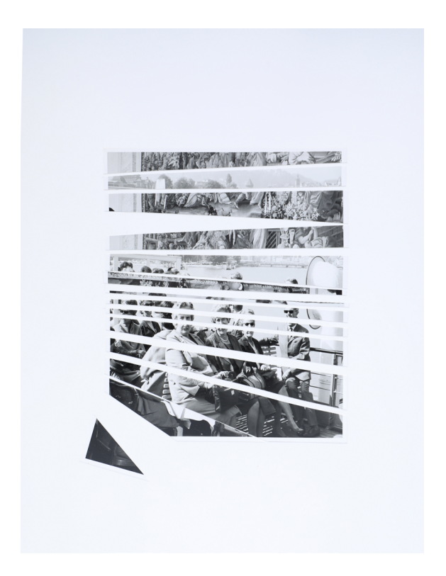
Gemma Pepper, Day Trippers, 2023 Photographie d'archive et mixed-media 24 x 30 cm, Unique piece

The use of images is exclusively reserved for the promotion of the exhibition and valid up to its end.