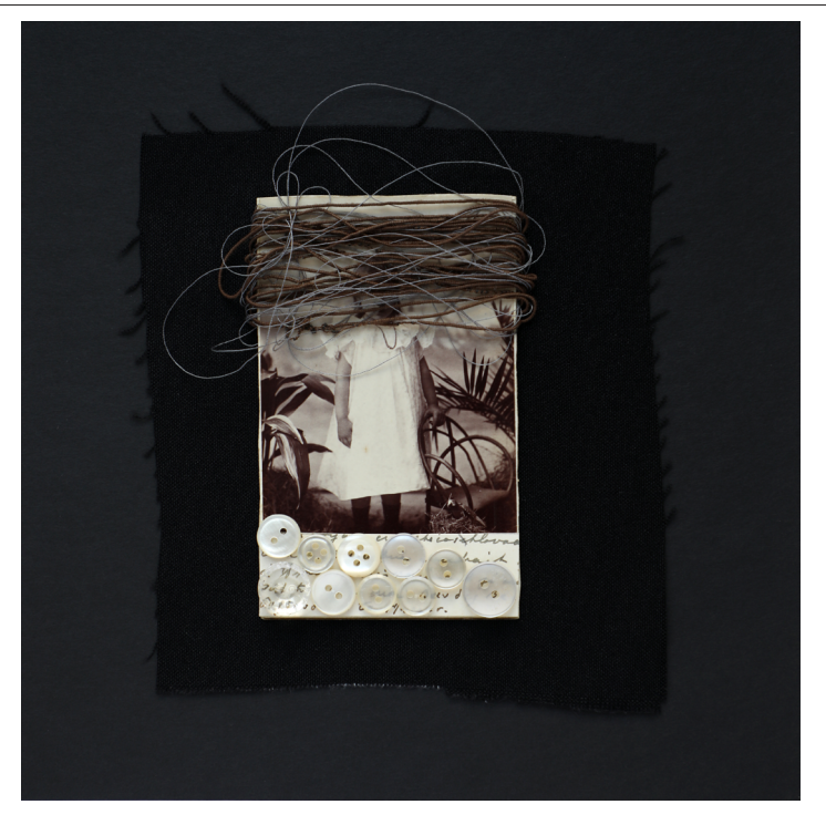
Gemma Pepper, The Seamstress' Daughter, 2023 Photographie d'archive et mixed-media 20 x 20 cm, Unique piece