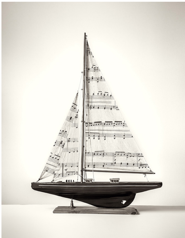
Chema Madoz, sans titre, 2022 Pigment inkjet print on archival paper, 50 x 60 cm