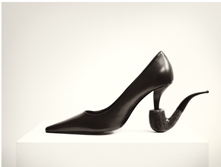
Chema Madoz, sans titre, 2023 Pigment inkjet print on archival paper, 60 x 50 cm

The use of images is exclusively reserved for the promotion of the exhibition and valid up to its end.