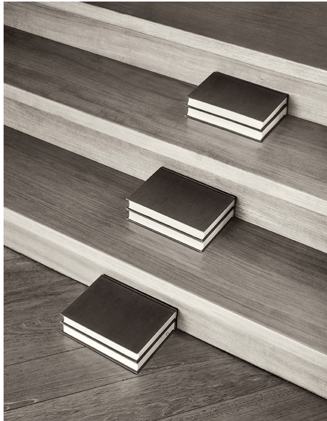
Chema Madoz, Galerie Elvira Gonzalez, Madrid, Espagne Chema Madoz. La nature des choses et leur écho dans la colle Herreriano, Valladolid, Espagne